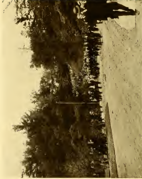
AFTER THE ADDRESS